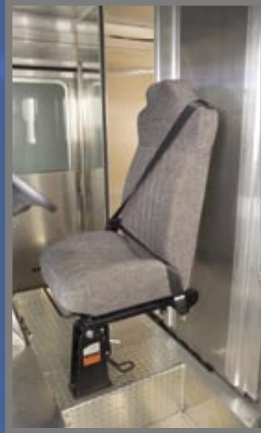
Driver and passenger seats available in variety of options, all ergonomically designed providing maximum comfort and support