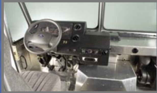
Driver compartment designed for easy access to cargo area and maximum driver visibility and comfort