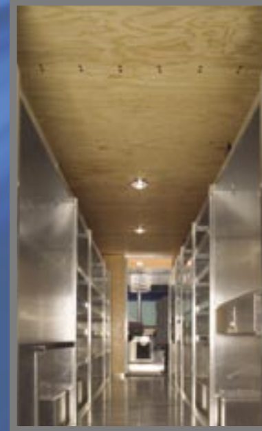
Cargo area customized to your business specific needs and delivery applications