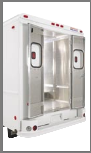
Various rear door configurations all designed to withstand constant use for the life of the vehicle